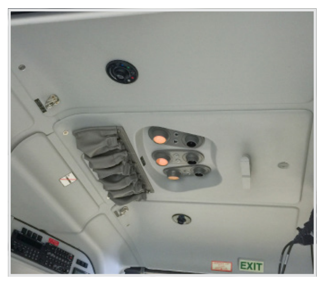
IV Hooks and Cabin Lights