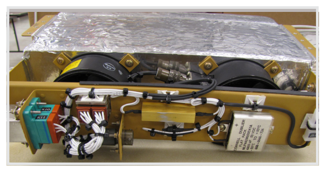
Mid Evaporator Assembly