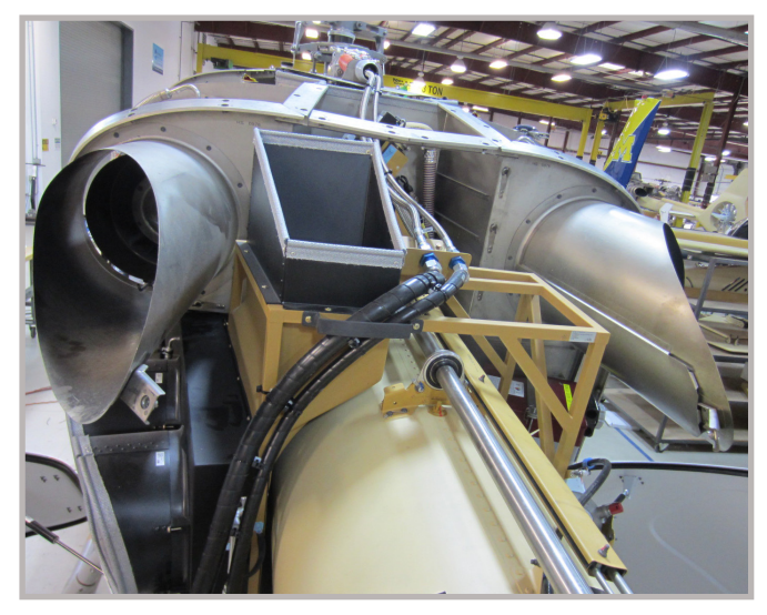
Compressor Frame Assembly

The Vapor Cycle Air Conditioning Kit 135AC-00-011 Applicable Models: EC135 P1/P2/P2+/T1/T2/T2+