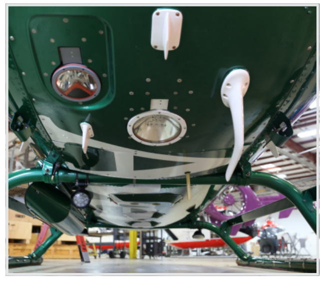
Controllable Searchlight and Auxiliary Lighting