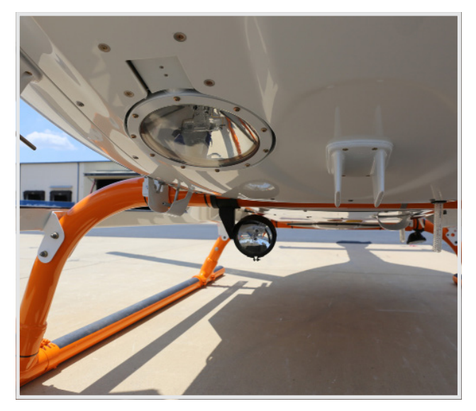
Controllable Searchlight and Auxiliary Lighting