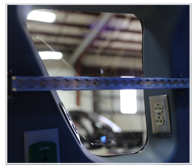
Window Accessory Bar