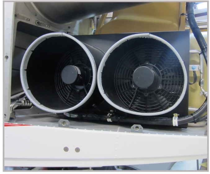
Condenser and Fan Assembly