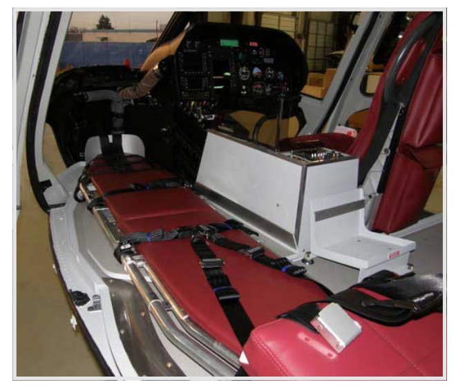
Quick Change Patient Litter System