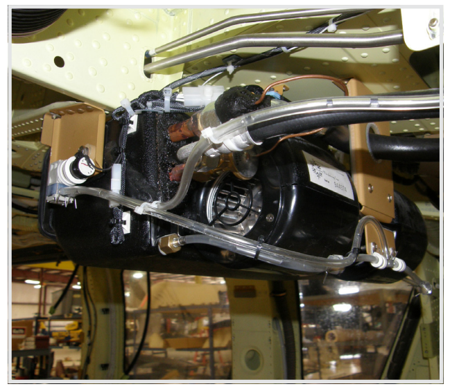
Aft Evaporator Installation