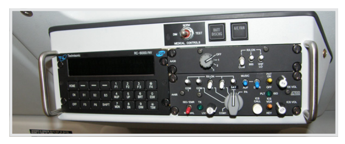
Medical Comm Panel