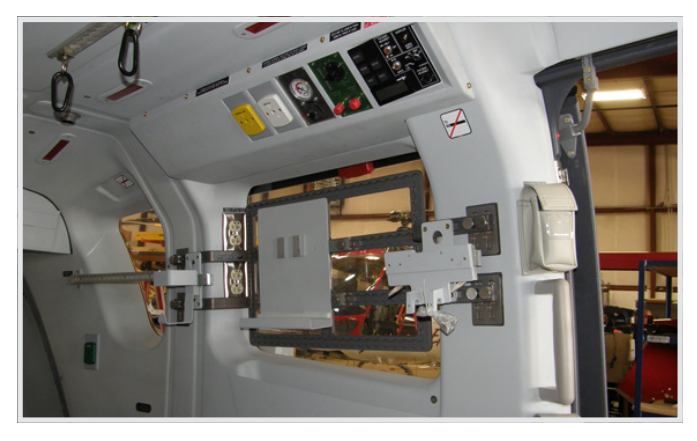
Medical Equipment Rack