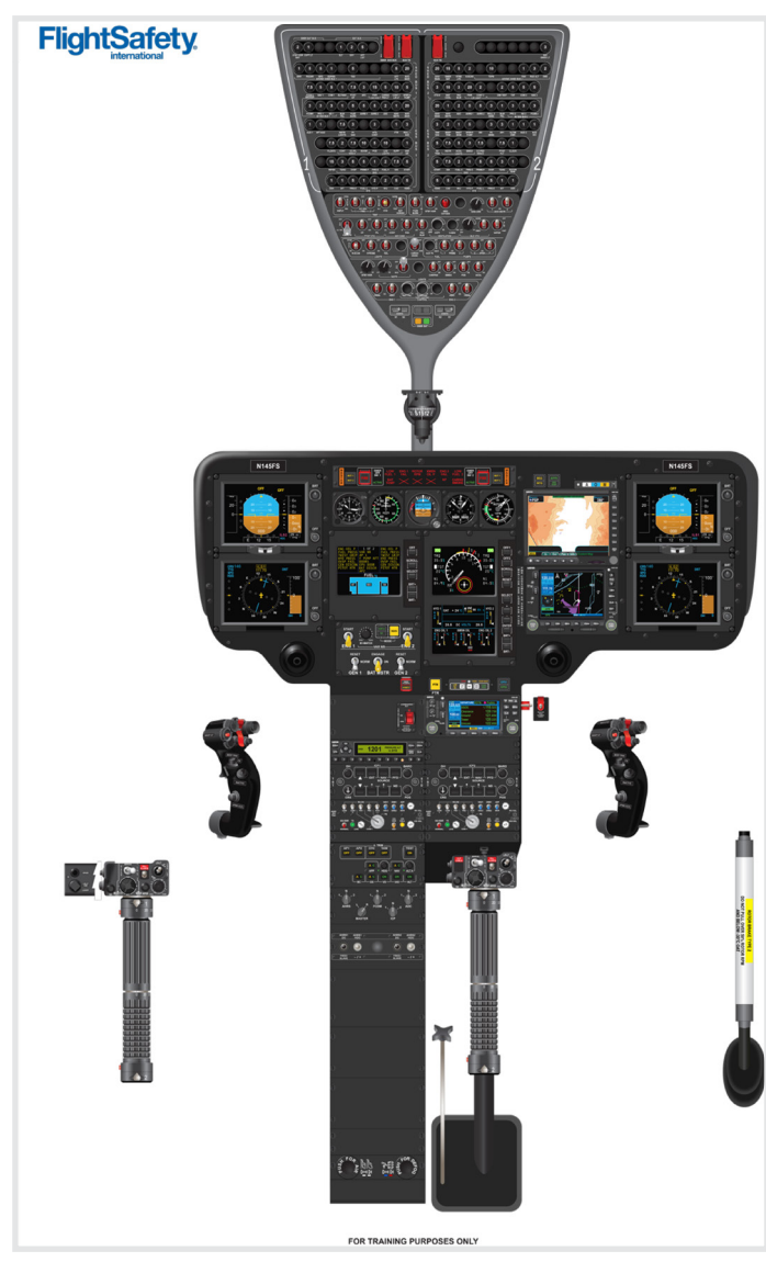
EC145 Cockpit from FlightSafety