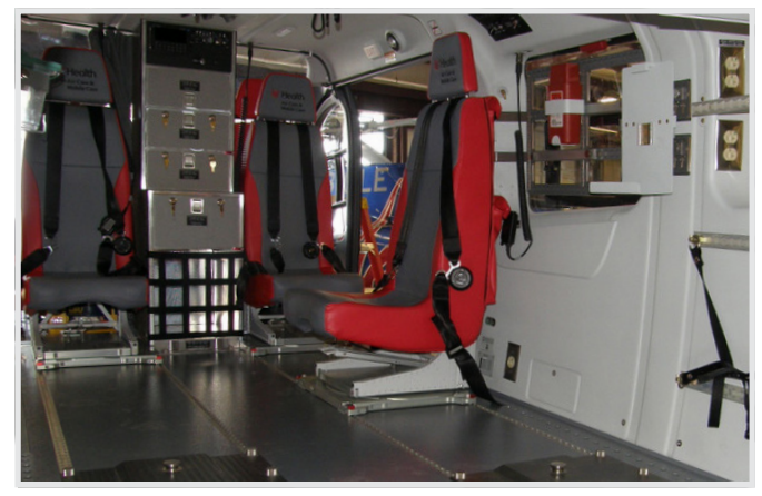
Track & Swivel Seat