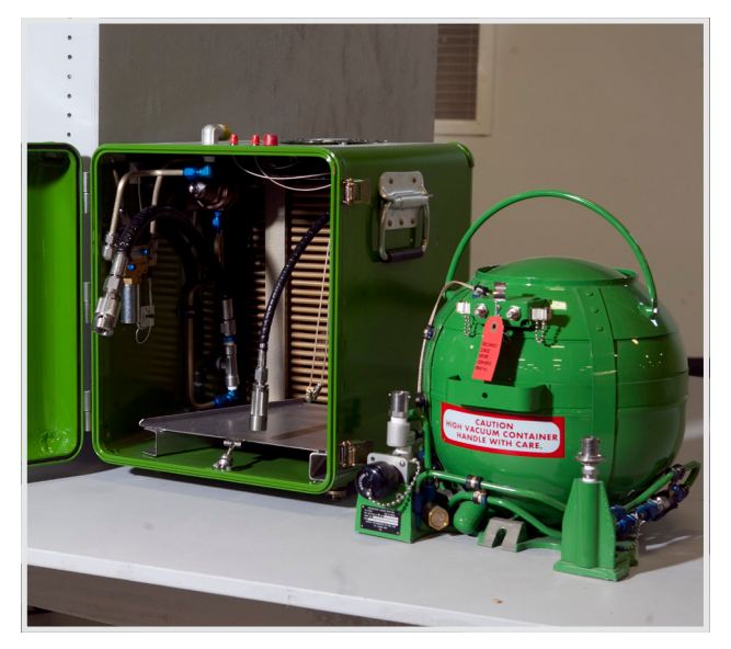
LOX (526-RTI Aero ORB)