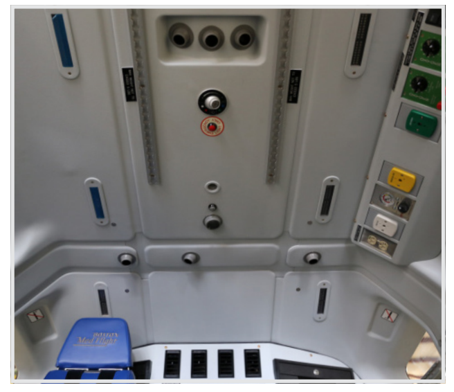
IV Rail and Cabin Lighting